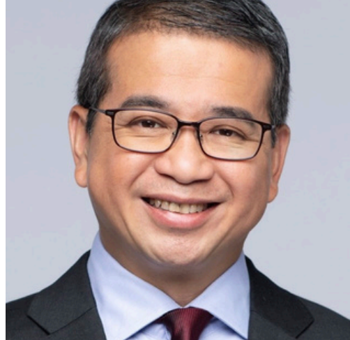
Edwin Tong SC Minister for Law and Second Minister for Home Affairs