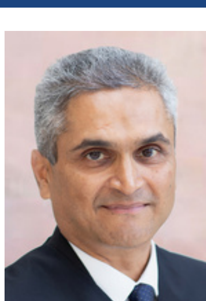
Justice S. Mohan Judge of the High Court, Supreme Court of Singapore